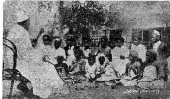
A MOHAMMEDAN SCHOOL

been Mohammedan schools for the boys dotted here and there over the country probably ever since there have been Mohammedans. Some of these schools have as many as forty or fifty pupils and some of the schools are composed of the teacher and two or three boys, out under a tree in a small village. The boys in these schools are mainly half-castes, of all shades from a light tan to a black. The hair ranges