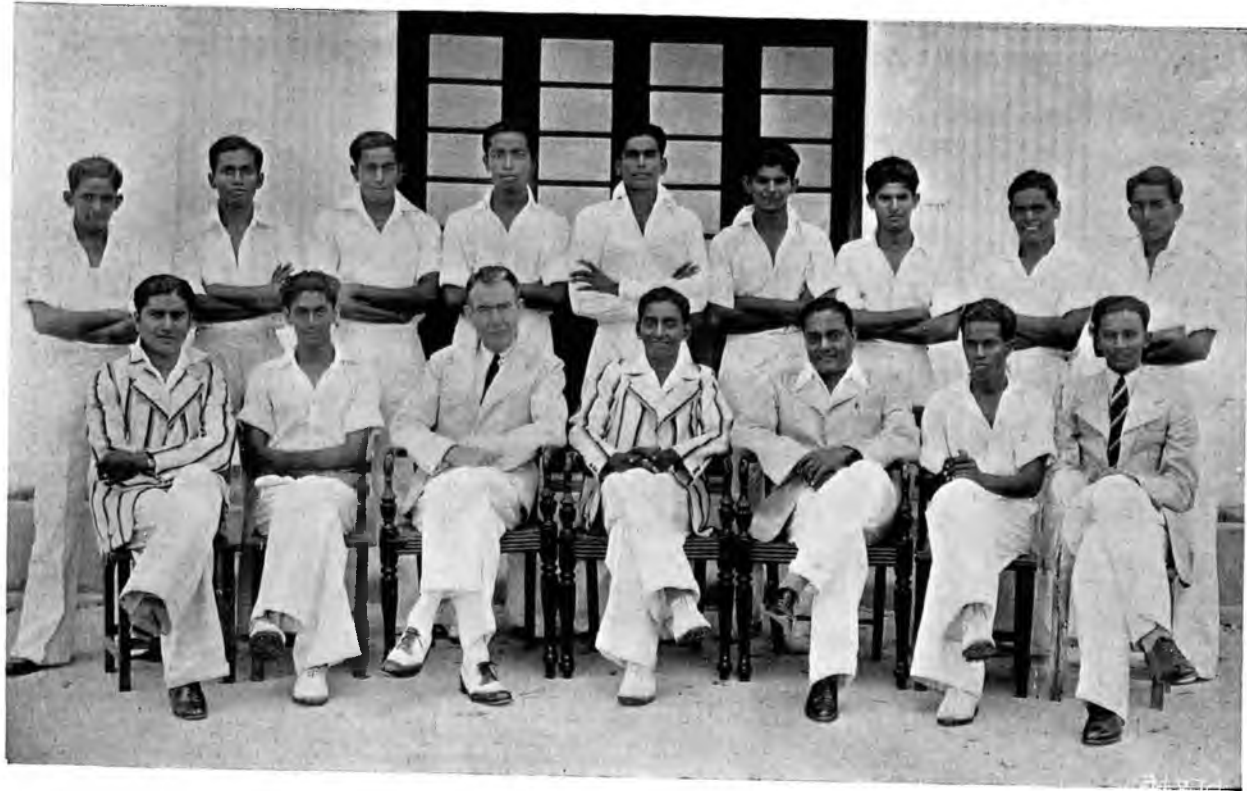
NORTH CEYLON INTER-COLLEGIATE CRICKET CHAMPIONS FOR 1941