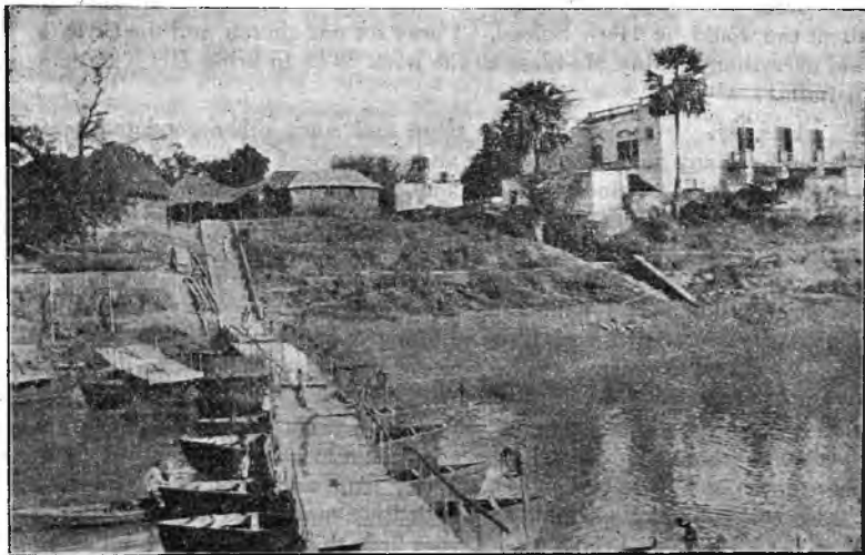
Pontoon Bridge, Ghatal.